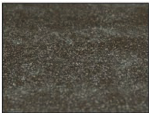
Without HIPE®ADD DSA

HIPE®ADD DSA is an efficient antidust agent with also smoothing effect useful in CPL, HPL and LPL applications. Often, due to several reasons like high drying temperature in the oven, no good resin penetration into the paper or high resin content, the surface of just impregnated paper may presents a lot of microbubbles that, breaking, generate a thin white powder both on paper and in the environment. This problem is more evident with white or unicolor papers and may become a very important issue to be solved.